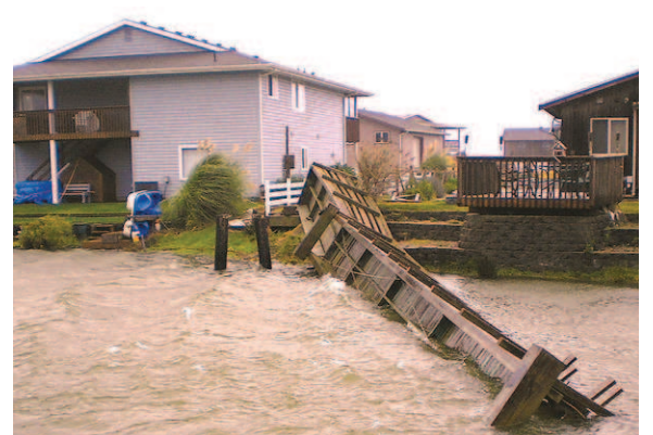
A footbridge at 344th in Surfside that had been condemned was destroyed by high winds December 3.