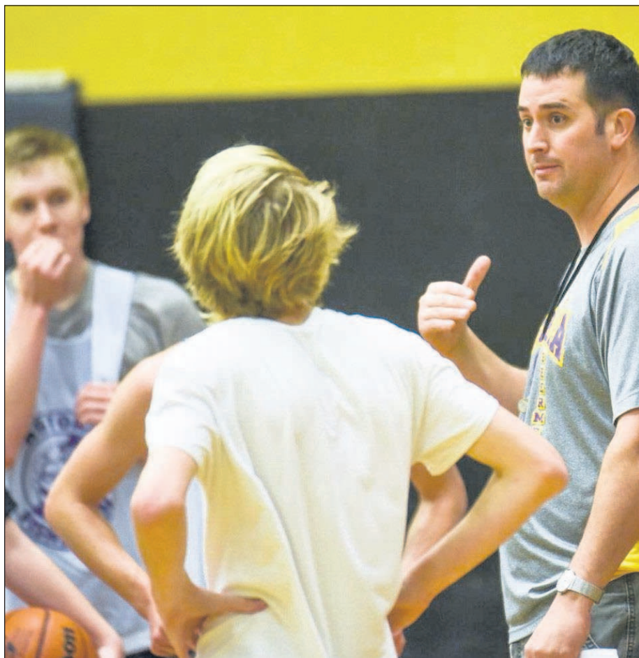
The Daily Astorian