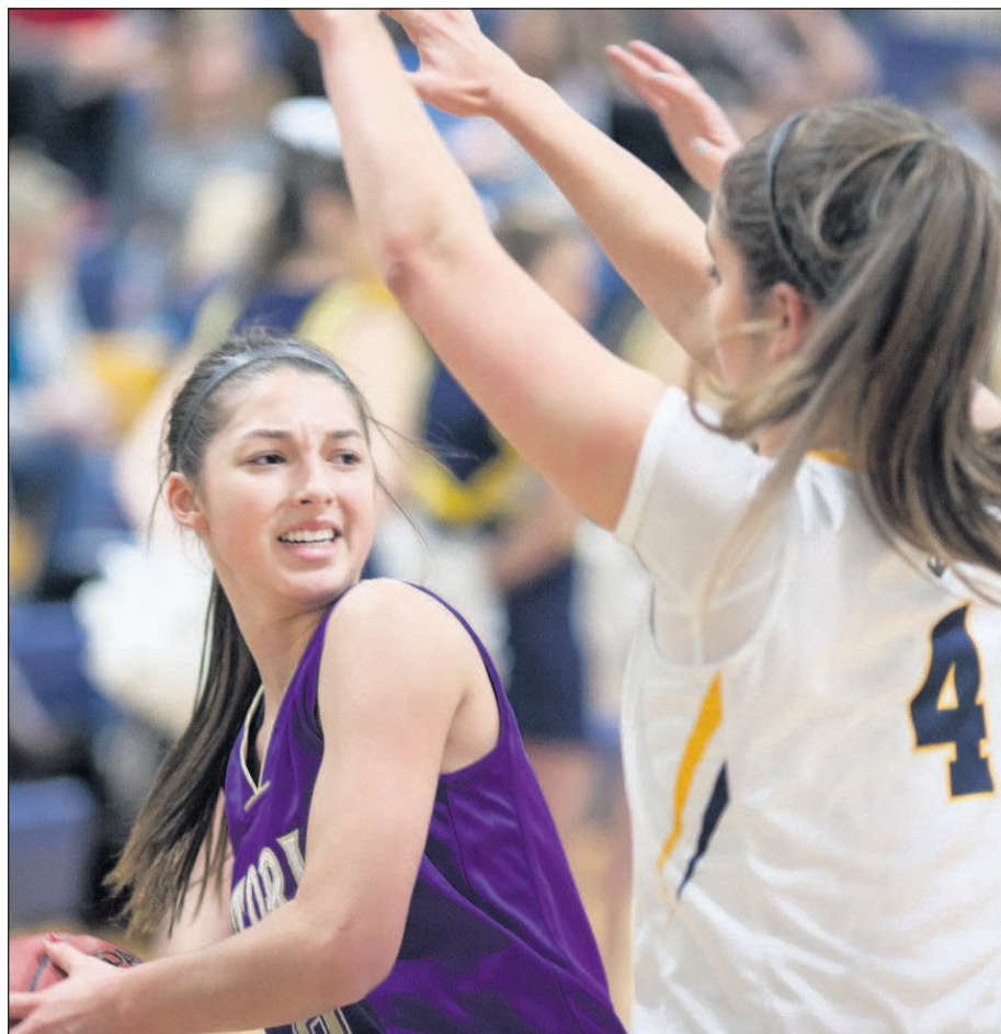
The Daily Astorian