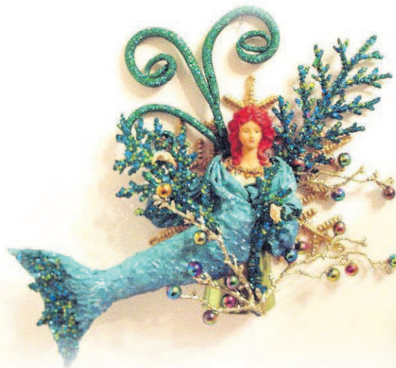
A mermaid at SunRose Gallery