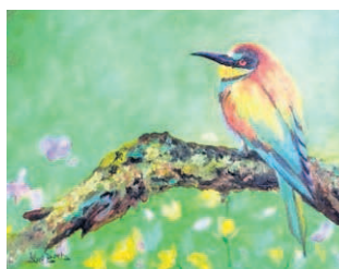
A colorful bird at Blue Bond Gallery

photographer Neal Maine will speak about the local habitat.