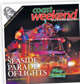
JEFF TER HAR PHOTO

8 FEATURE Seaside Parade of Lights Yuletide in Seaside celebrates 44th year