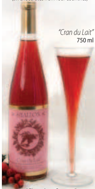
"Cran du Lait" 750 ml

Pure CHOCOLATE wine (six chocolates from four countries)