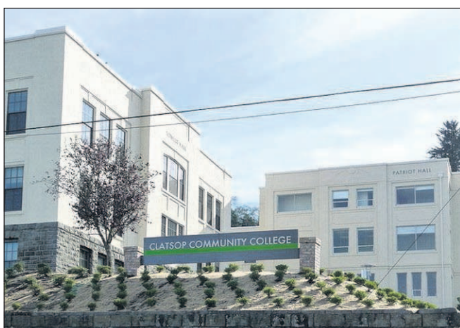
Clatsop Community College has struggled to craft a tobacco-free policy.

The Clatsop Community College Board once again sent a tobacco-free policy back to the drawing board over concerns of truth in advertising and to add stronger language about prevention and education.