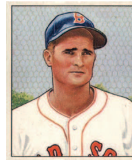
1950 Bowman baseball card of Bobby Doerr

He helped the Red Sox win the AL pennant in 1946 — the only time his teams got past the Yankees — but they lost Game 7 of the World Series to the St. Louis Cardinals.