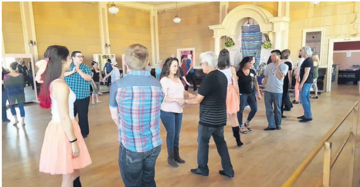
Dancers at Astoria's Arts & Movement Center

The prorated price is $15 per person to drop in per class, $25 per person per class to drop in to both ballroom and West Coast Swing.