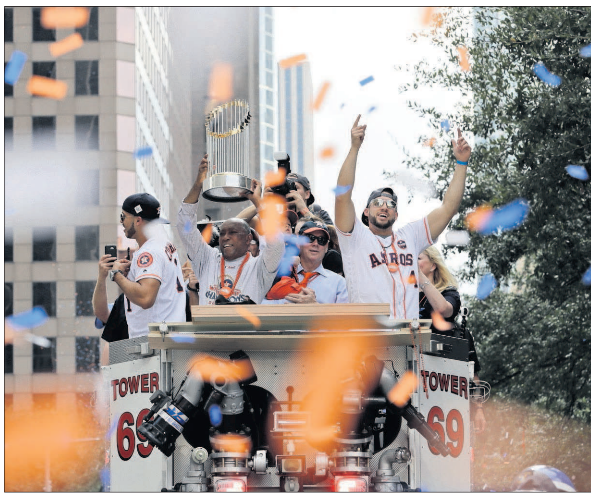
Houston Astros' Carlos Correa, left, Houston Mayor Sylvester Turner, with World Series trophy, and World Series MVP George Springer ride on top of a fire truck during a parade honoring the World Series baseball champions Friday in Houston.