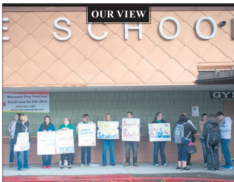
Public schools and local governments are struggling to meet pension obligations.