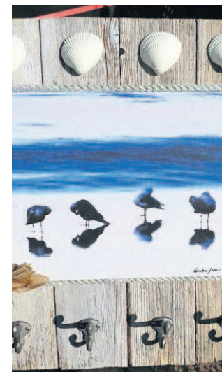
A piece at SunRose Gallery