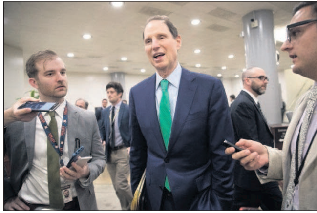
U.S. Sen. Ron Wyden, an Oregon Democrat, has emerged as a leading critic of the GOP tax plan.

Wednesday. But just the rough sketches have been enough to turn Wyden into a leading opponent. "Our job right now is to show that what is essentially on offer today is a huge array of goodies and breaks for the people at the top," Wyden said in an interview in his Capitol Hill office Thursday. The senator argued that GOP leaders and Trump have made so many promises to their wealthy donor base that they have to "dip into the middle-class person's pockets" to help finance it. Wyden said this could be particularly true for Oregon taxpayers because the GOP plan contemplated removing the federal deduction for state and local taxes. A report from the nonpartisan Government Finance Officers Association found that only six states had