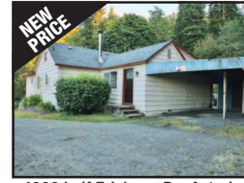
4809 Leif Erickson Dr., Astoria $255,000