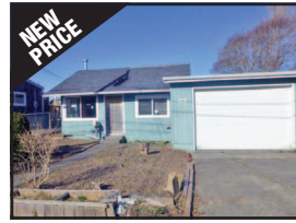
840 11th Ave., Seaside $129,900