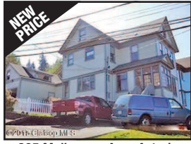
285 Melbourne Ave., Astoria $349,000