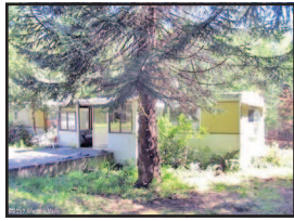
93053 Brownsmead Hill Rd., Astoria $110,000