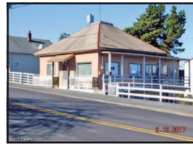
474 Bond Ave, Astoria $209,900