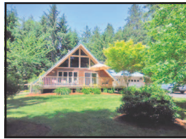
91085 Hwy 202, Astoria $415,000