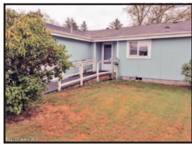
1100 NW Warrenton Dr., #342, Warrenton $69,000