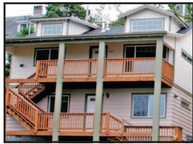
1089-1099 Irving, Astoria $689,000