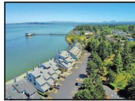
735 Point Triumph Condo #10, Hammond $395,000