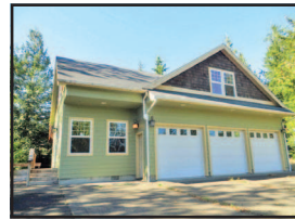
36323 Riverpoint Dr., Astoria $597,465