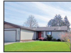
1100 NW Warrenton Dr., #344, Warrenton $90,000