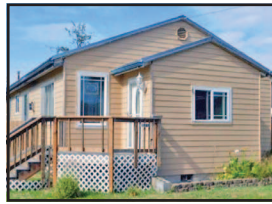
1095 Pacific Dr., Hammond $209,900