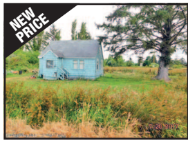
35063 5th Ln., Astoria $89,999