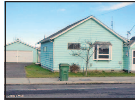
625 E. Harbor, Warrenton $135,000