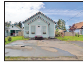
45 NW Birch Ave., Warrenton $189,900