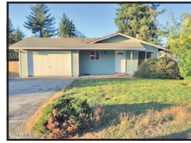
41957 Wickiup Terrace Ln., Astoria $249,999