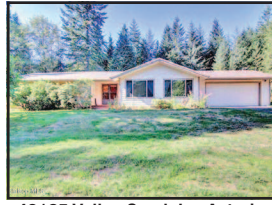
43125 Valley Creek Ln, Astoria $395,000