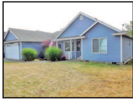
761 SW Juniper, Warrenton $309,000