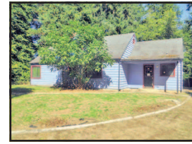
37630 Brandon Ln., Astoria $144,900