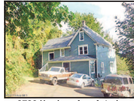
3730 Harrison Ave. Astoria $325,000