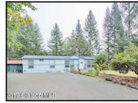
41757 Woodward Ln., Seaside $259,500