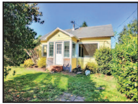
92938 Maritime Rd., Astoria $135,000