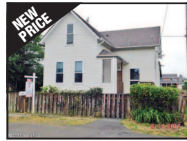
881 Pacific Dr., Hammond $185,000