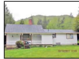
87301 Hwy 202, Astoria $360,000