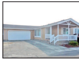
1100 NW Warrenton Dr., #361, Warrenton $65,000