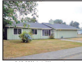
242 NW 1st, Warrenton $312,000