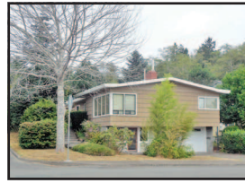
1792 5th St., Astoria $275,000