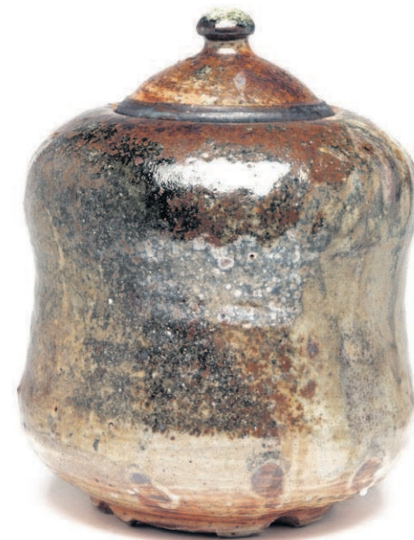
"Tea Caddy With Obsidian Top" by David Campiche

Tickets for the auction are available at the museum for $15 each. Fifty raffle tickets are available for $20 each. The winner will have the pick of any 6x6 prior to the auction.