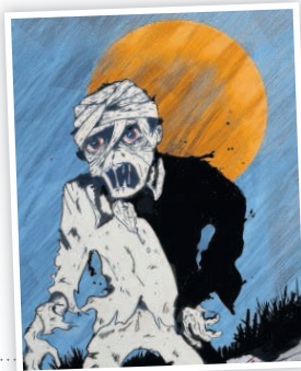
ILLUSTRATION BY DYLAN TANNER

10 FEATURE 'Beware the Bandage Man: Part I' A North Coast horror story