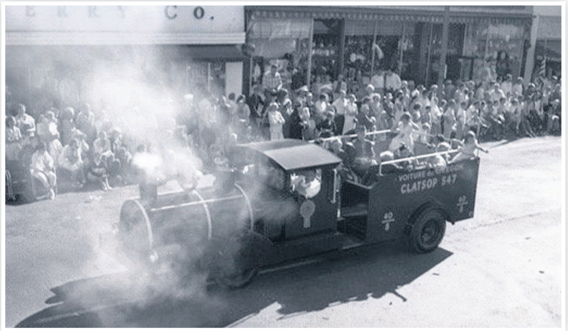
The Compleat Photographer

The Clatsop Voiture 547’s driving Forty & Eight train during an Astoria Regatta parade in the late 1950s.