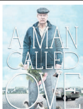
"A Man Called Ove" (2015) is a dramedy about an unexpected friendship.