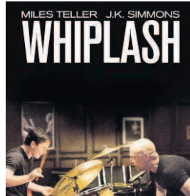
"Whiplash" (2014), about an aspiring drummer and his intense teacher, won J.K. Simmons an Oscar for Best Supporting Actor.