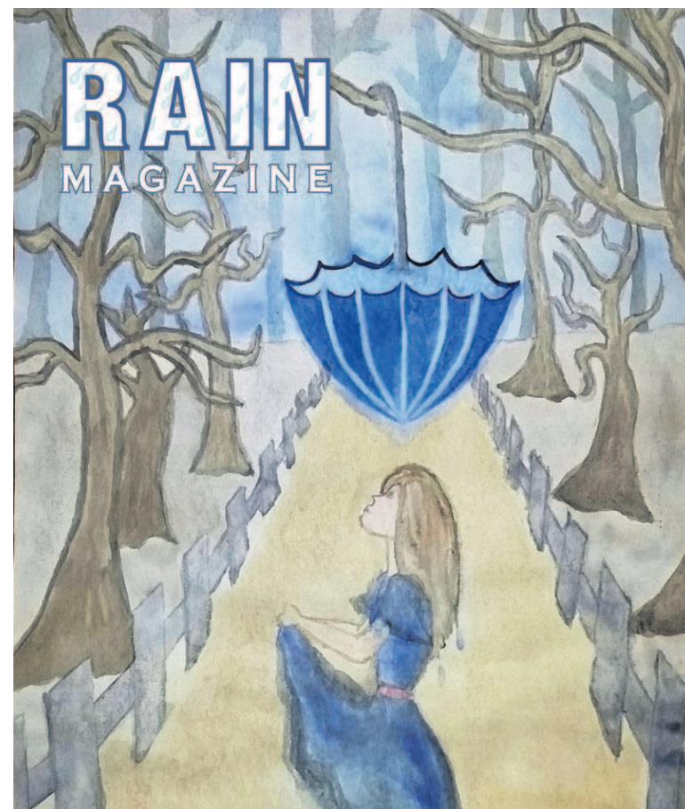
The cover of Rain Magazine 2017