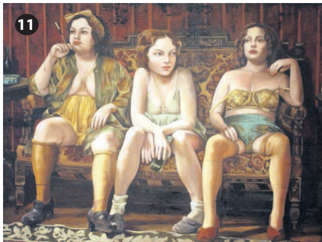
11 SUBMITTED PHOTOS Jill McVarish's "Three Graces," on display at RiverSea Gallery