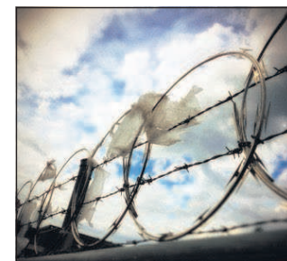
SUBMITTED PHOTO "Blue Sky Barbed" by Julie Moore

"Now, decades later, the tie dye clothes are as tattered