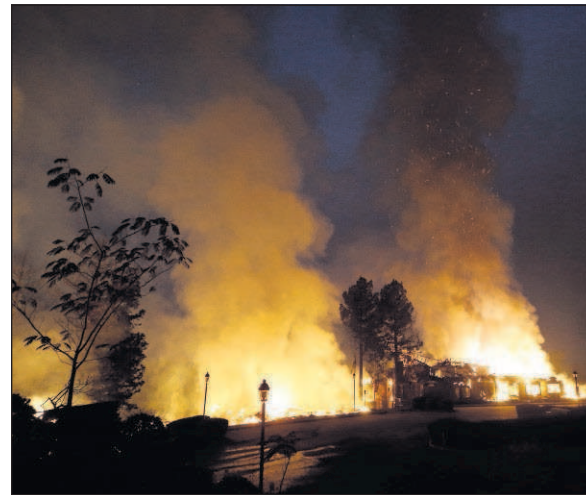
Smoke and flames from fire at the Hilton Sonoma Wine Country hotel in Santa Rosa, Calif.

The flames were unforgiving to both groups. Hundreds of homes of all sizes were leveled by flames so hot they melted the glass off of cars and turned aluminum wheels into liquid.