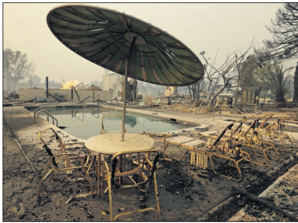
Fire burns from an open gas valve near the pool area at the Journey's End trailer park in Santa Rosa, Calif., after a wildfire destroyed nearly all of the roughly 160 units in the park for residents over age 55.