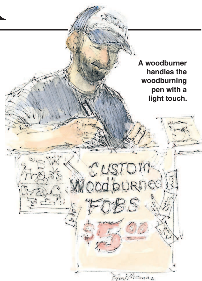
A woodburner handles the woodburning pen with a light touch.

Thomas' work can be seen at RiverSea Gallery in Astoria.