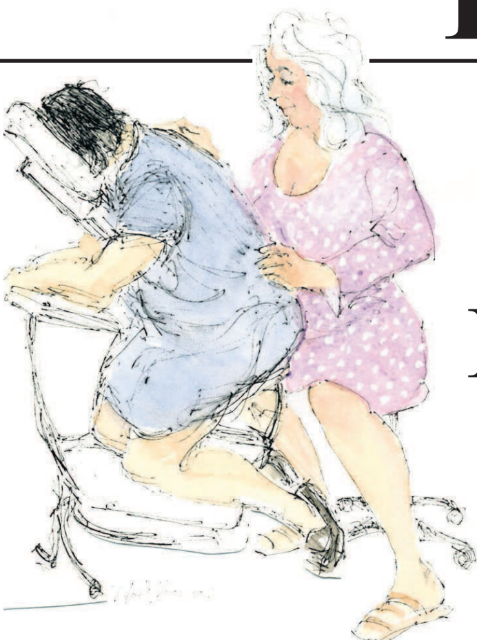
Paintings by Noel Thomas The Astoria Sunday Market is so spread out you might need a massage after shopping. This woman's therapeutic hands can fix you up.