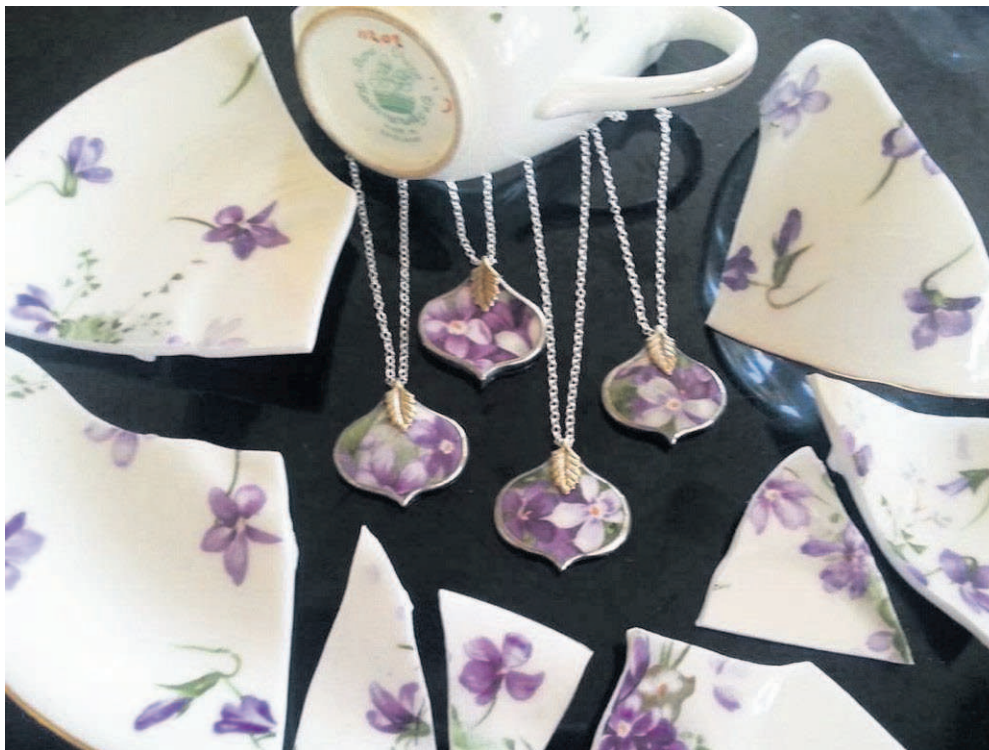
A piece at SunRose Gallery

"As I contemplated the subject of 'Shadows,' I found inspiration in a variety of perspectives around the