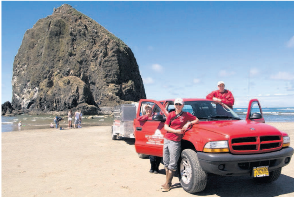
The Haystack Rock Awareness Program interpreters

This program is a cooperative effort between the Cannon Beach Chamber of Commerce, Haystack Rock