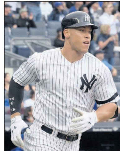
New York Yankees’ Aaron Judge.

PUERTO RICO — Carlos Beltran, Francisco Lindor and Carlos Correa are among the many players from Puerto Rico trying to raise money and awareness for the damage done to their island by Hurricane Maria. Look for messages on caps and shoes over the next few weeks.