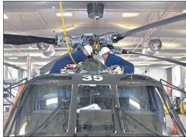
Two Coast Guard technicians install a part during routine maintenance at Air Station Astoria.

"They go back to North Carolina and get completely revamped," he said. "All the