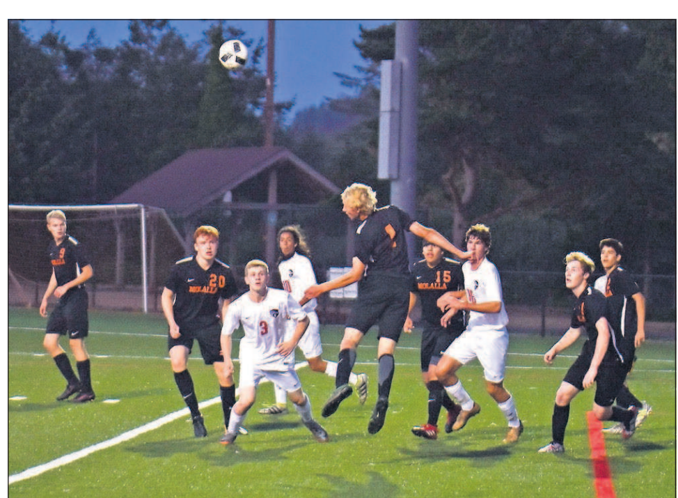
A Molalla defender heads the ball away from the Seagull offense.