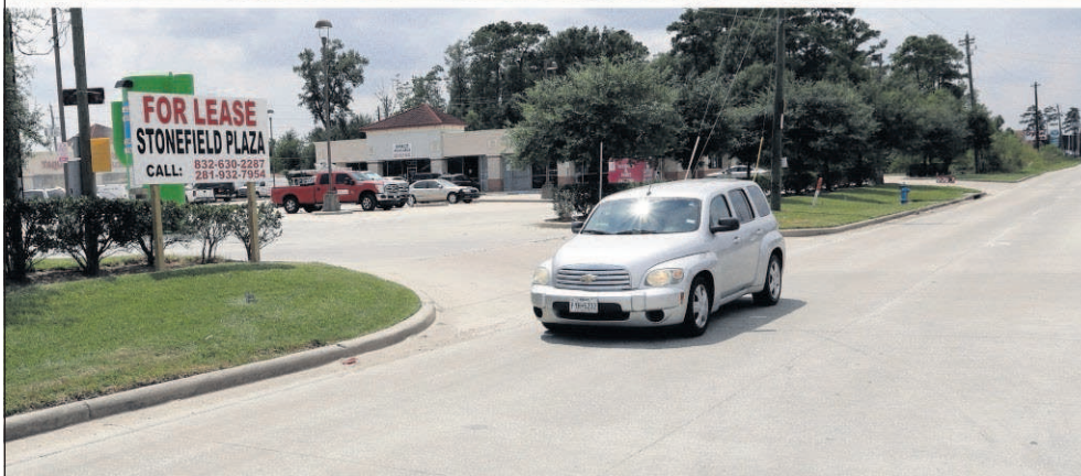
In this photo combination, evacuees wade down Tidwell Road in Houston on Aug. 28, 2017, top, as floodwaters from Tropical Storm Harvey rise, and a car drives down the same road on Tuesday, bottom, after the water receded.