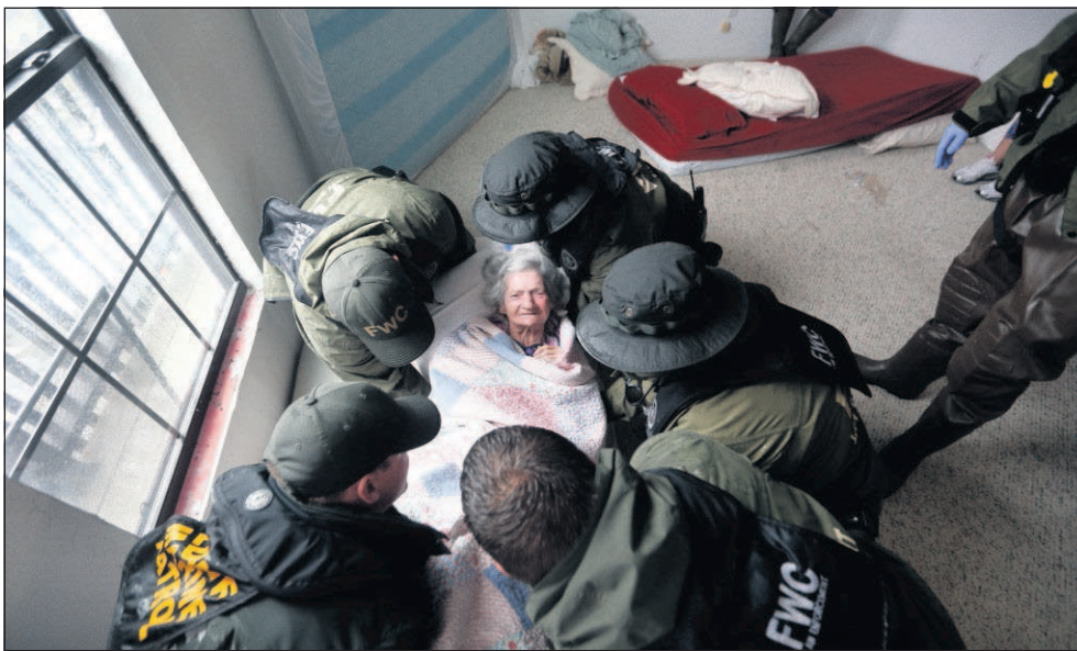
Members of the Louisiana Department of Wildlife and Fisheries, the Florida Fish and Wildlife Conservation Commission, and the Louisiana National Guard help rescue with elderly people from the Golden Years Assisted Living home, which was flooded from Hurricane Harvey in Orange, Texas.

"In Harvey, nobody is talking about race. It's just, 'What do you need?'"