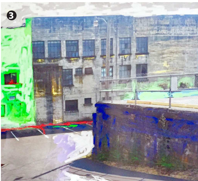
A piece of the Brenda Harper's "Imaginary Architecture" exhibit at AVA Pop-Up Space

Celebrate September with the incredible artwork of Ashland artist Denise Kester. "Drawing on the Dream" explores Kester's unique view of the world through dreamscape images and universal archetypes. Using acrylic, ink and watercolor, she creates colorful detailed and familiar musings of animals, humans