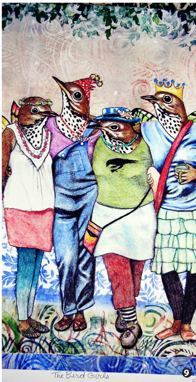
The Bird Girls

Beach House Teas are passionate about creating delicious teas using only the finest organic or wild harvested ingredients — that's why they're Vintage Hardware's September pop-up shop. Beach House Teas begins by sourcing ingredients from quality local farms and distributors, then hand-mix all their original blends in small batches on the Long Beach Peninsula, capturing the beautiful aromas and flavors of the Pacific Northwest.