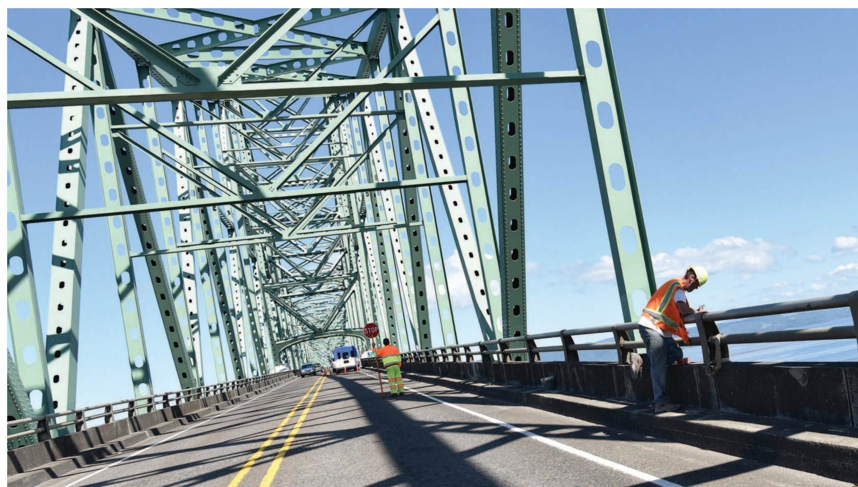
Work on the Astoria Bridge that began in 2009 continues below and above the roadway, as crews control traffic while repairs are made to the structure.