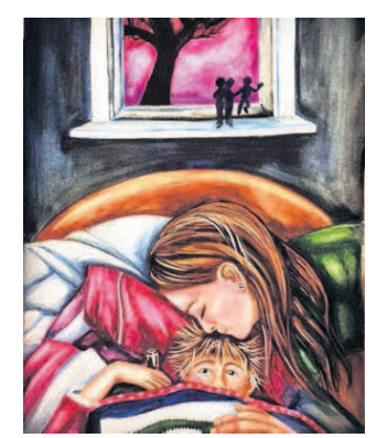
A piece by Emily Lux

The summer art season ends with a most perfect exhibition titled "Color It Fall." New original art compositions revolve around the complementary clash of the deliberately heightened blues, bright oranges and warm yellows.