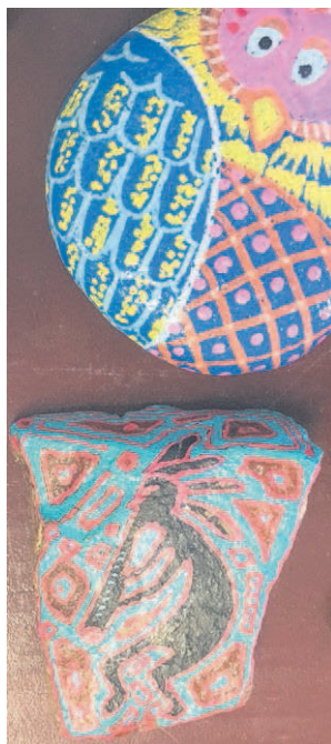
ASTORIA ART LOFT

Rocks are all around us, in all sizes, colors, and textures. And what do you paint rocks with? You can use house paint, watercolors, markers, acrylics. You can even glue pictures onto rocks for decoupage.