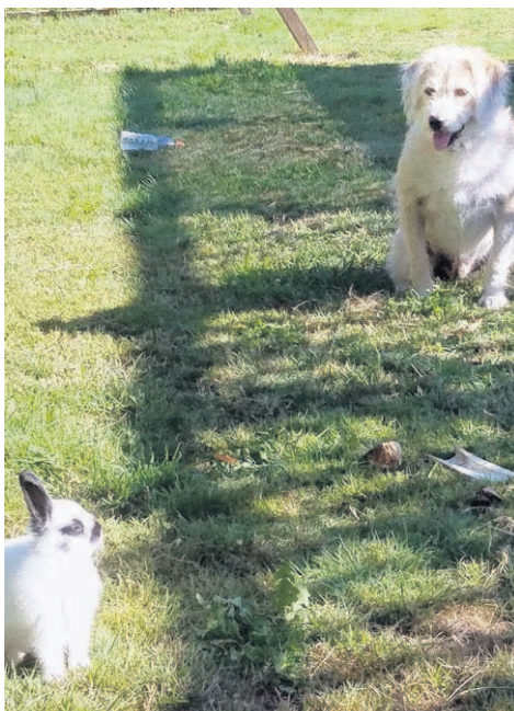
Vegeta is a mix of collie, spaniel, and wire hair fox terrier and is part of the Vinson/O'Shay family.