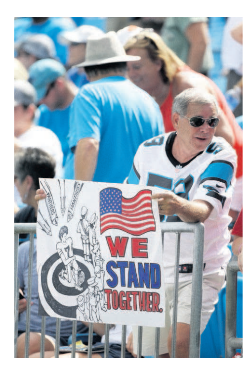
A Carolina Panthers fan holds his sign in protest in September of the San Francisco 49ers Colin Kaepernick.

Just weeks away from the regular season, he has become a symbol of the clash of celebrity, sports and social issues as more people -including players, fans, politicians, team owners and pundits — invoke his name to debate thorny issues of patriotism and race. Other prominent NFL players have sat out or demonstrated during anthems this preseason, one saying his decision was bolstered by a recent white supremacists' rally in Virginia