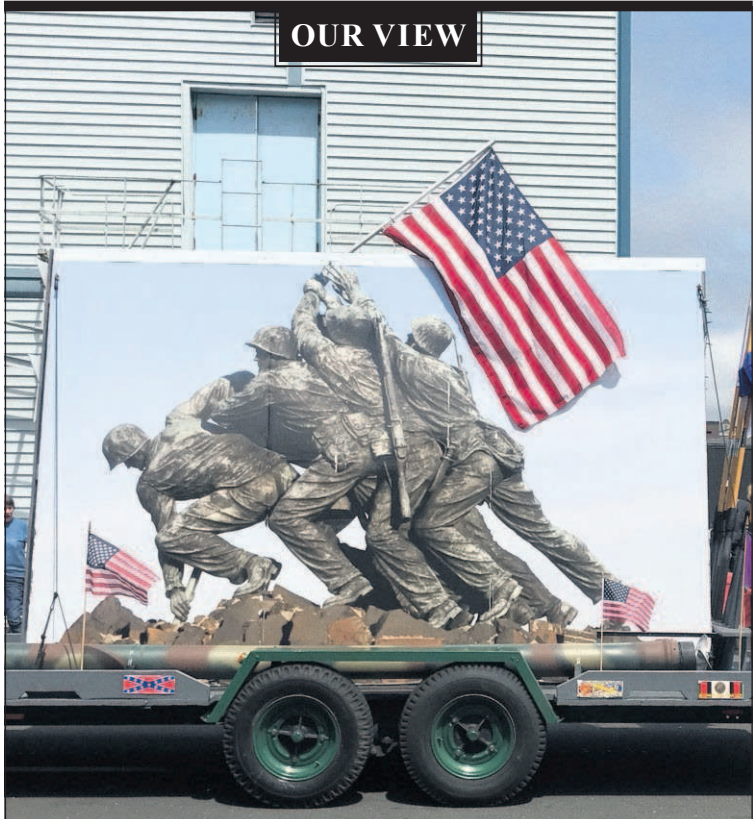
A Regatta parade float by Sons of Beaches featured U.S. and military flags, along with a Confederate flag decal on the trailer.