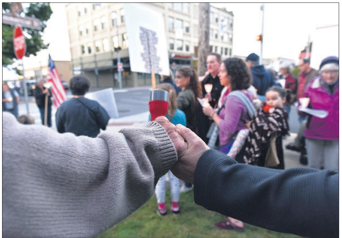
Dozens of people showed up in Astoria Sunday evening to hold a candlelight vigil to remember the victims of violence in Charlottesville, Va.