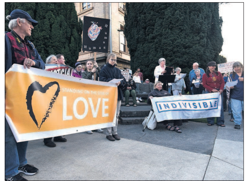
People gathered Sunday evening in Astoria to sing songs and hold a candlelight vigil in honor of the victims of violence in Charlottesville, Va., over the weekend.

Notably, the speakers named the source of the problem. White nationalism. White supremacy. The euphemistically labeled "alt-right."