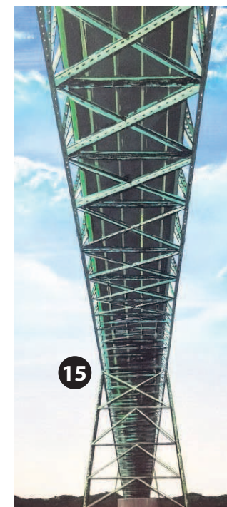
A painting by Cody Fox, on display at Old Town Framing