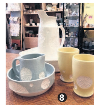
Introducing Sharon Greenwood Pottery at Forsythea Home & Garden Art