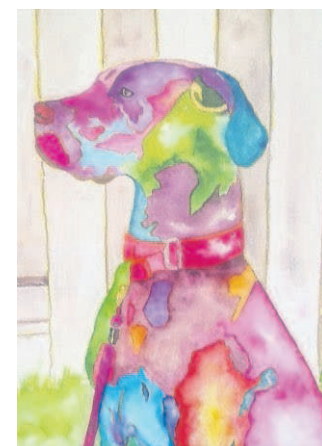
Cal von Kugler's "Magikul Dog," featured at Beach Puppy