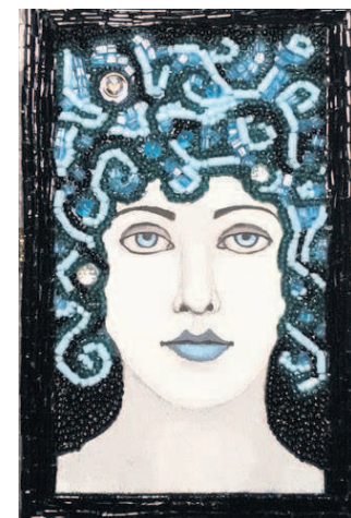
"Mermaid" by Zemula Fleming featured at SunRose Gallery