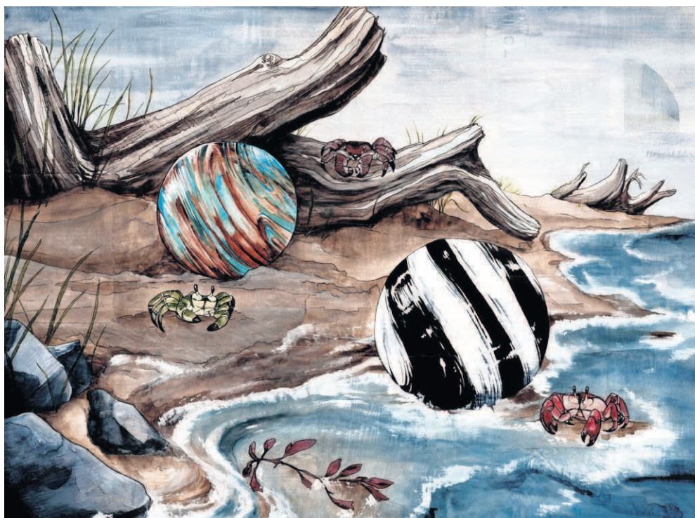
"A Curious Discovery" by Whelpsy Whelp at Fairweather House & Gallery

Featuring the Magikul Art by Cal von Kugler, who creates canine- and feline-themed watercolors, jewelry and gift cards.