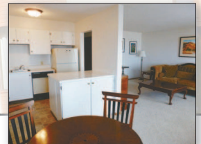
Simplify Your Life