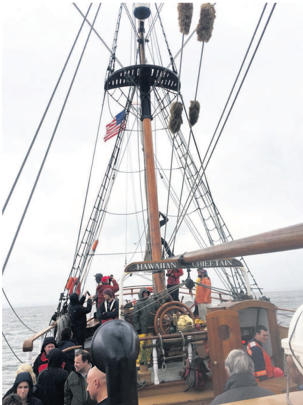
The Hawaiian Chieftain at sea

The 104-foot ship sails into our waters once or twice a year. Along with the Lady Washington, she shares a time and space that we somehow envy — though, in fairness, sailing under a national flag in the eighteenth and nineteenth centuries (be it French, En-