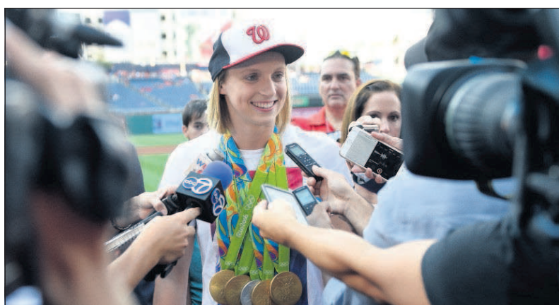
Olympic gold-medal swimmer Katie Ledecky talks to the media before a baseball game between the Baltimore Orioles and the Washington Nationals, in Washington in August. Ledecky shrugs off the notion that she's doing anything special. Ledecky will race every day for seven straight days at the world championships in Budapest.

To add a little perspective, Michael Phelps put in 3,300 meters — roughly half the distance of Ledecky's program — on his way to a record eight gold medals at the Beijing Olympics. No one is aware of a pool swimmer