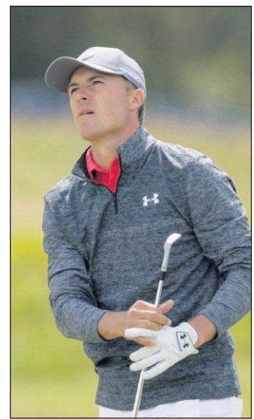
Jordan Spieth of the United States plays a shot on the 18th hole during the first round of the British Open Golf Championship, at Royal Birkdale, Southport, England Thursday.