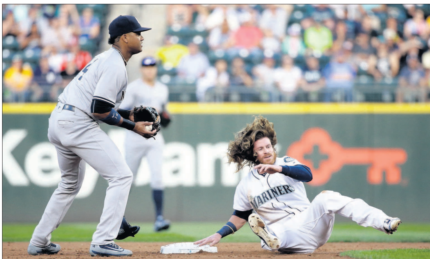
Seattle Mariners' Ben Gamel, right, tumbles after being tagged out on a run-down as New York Yankees second baseman Starlin Castro looks toward first during the first inning of a baseball game Thursday in Seattle. Yankees beat the Mariners 4-1.

"I could easily stay in Nevada, but I don't think you guys want me here," he joked.