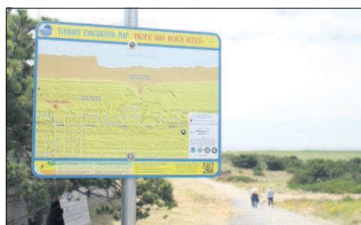
An evacuation route sign at the end of Pacific Way in Gearhart.

The county does not have clear records of how many signs exist and where they