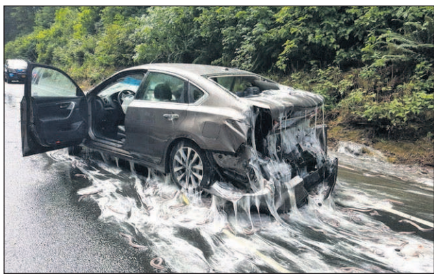
Oregon State Police

Police said Salvatore Tragale was driving north with 13 containers holding 7,500 pounds of hagfish, which are