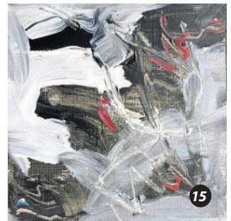
SUBMITTED PHOTO "Abstract 1," acrylic, by Vicki Baker at Tempo Gallery

at the Pantry! Well, Naked Lemon will be popping up at the Pantry for July's Art Walk. Delectable treats and delicious baked goodies.