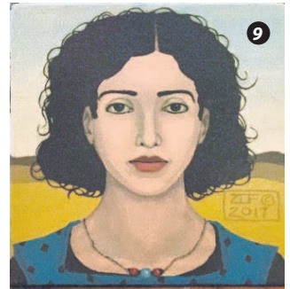
SUBMITTED PHOTO A piece by Zemula Fleming at Forsythea Gallery