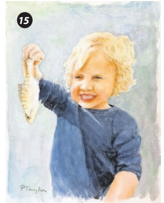
SUBMITTED PHOTO "First Fish," a watercolor by Phyllis Taylor at Tempo Gallery