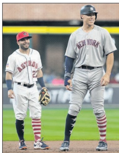
New York Yankees' Aaron Judge, right, and Houston Astros second baseman Jose Altuve have a conversation during the first inning of a baseball game Sunday in Houston. Both players have been elected to start in the All-Star Game in Miami on July 12.

"It's something that you dream about since you are a little kid, since you get drafted, since you sign a pro-