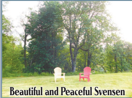
Beautiful and Peaceful Svensen

1.06 Acres Offered at $115,000 Surveyed Septic Approved Utilities Available