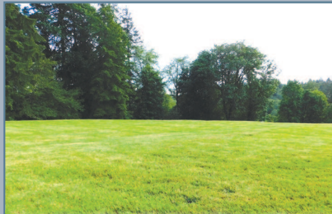
Imagine Your Perfect Home Here!

1.06 Acres Offered at $115,000 Surveyed Septic Approved Utilities Available