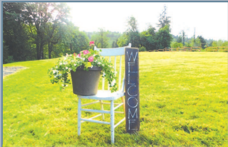
Warm & Welcoming Sunfield Lane