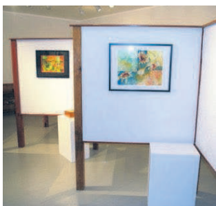
ABOVE: Trail's End Gallery interior