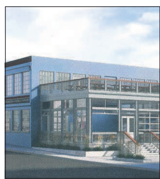
Fort George Brewery will enclose its first-story patio, adding a second-story patio on top.

He said construction will start in October, with a goal to finish by the popular Festival of Dark Arts stout beer festival in February.