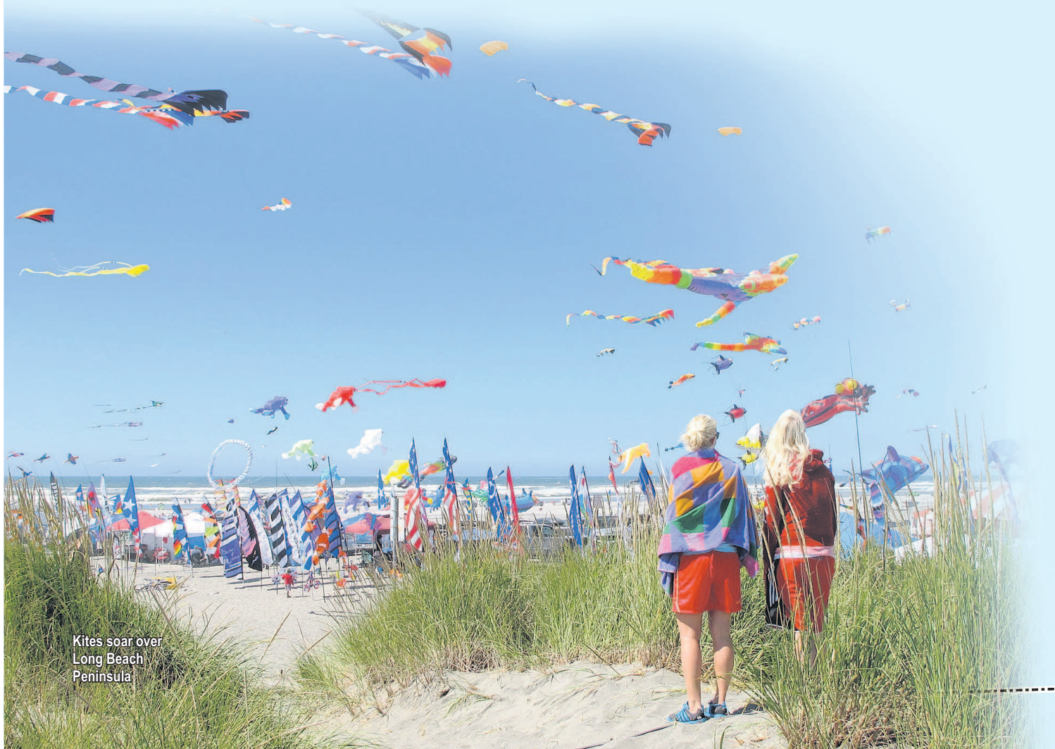
Kites soar over Long Beach Peninsula