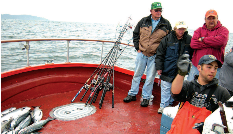
Buoy 10 salmon season inside the Columbia River in August is one of the Pacific Northwest's most famous outdoor events. In this photo, the Ilwaco charter boat Coho King caught its limit by 10 a.m.

N othing compares to the exhilaration of boating over waters where the Columbia River, having reached journey's end, rushes into the Pacific Ocean. Add the thrill of catching large game fish and the experience will be imprinted in memory forever.