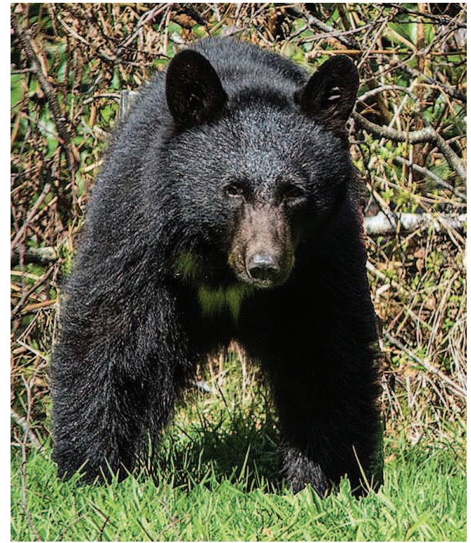
Black bears are active on the Long Beach Peninsula and nearby areas, which have Washington state's densest populations of bears. It's important to keep human-related food sources out of their reach. Bears that become habituated to human-supplied food represent a danger to people. They often must be removed and euthanized. It's up to each of us to keep our bear neighbors safe.