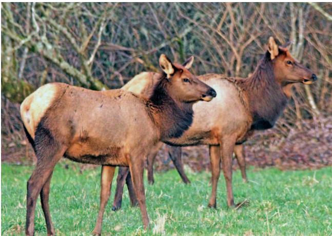
Roosevelt elk can often be seen in a viewing area off U.S. Highway 101 on Bear River on the south end of Willapa between Long Beach and South Bend. A resident herd of elk also occupied wild lands on the Long Beach Peninsula, but exact locations for them are difficult to predict.