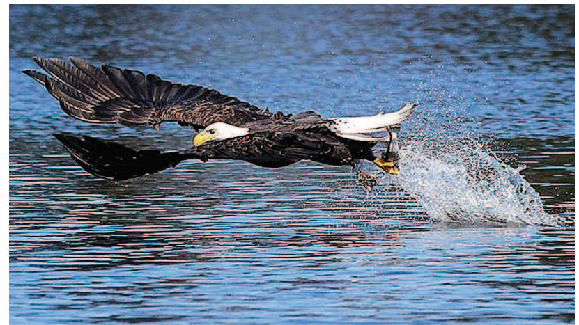
A bald eagle snatched a fish from a Long Beach Peninsula lake in late April 2017. Eagles are an everyday sight throughout the Columbia-Willapa area.