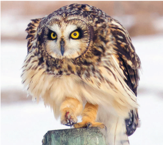
Short-eared owls are year-round residents of Willapa National Wildlife Refuge, one of several owl species here.