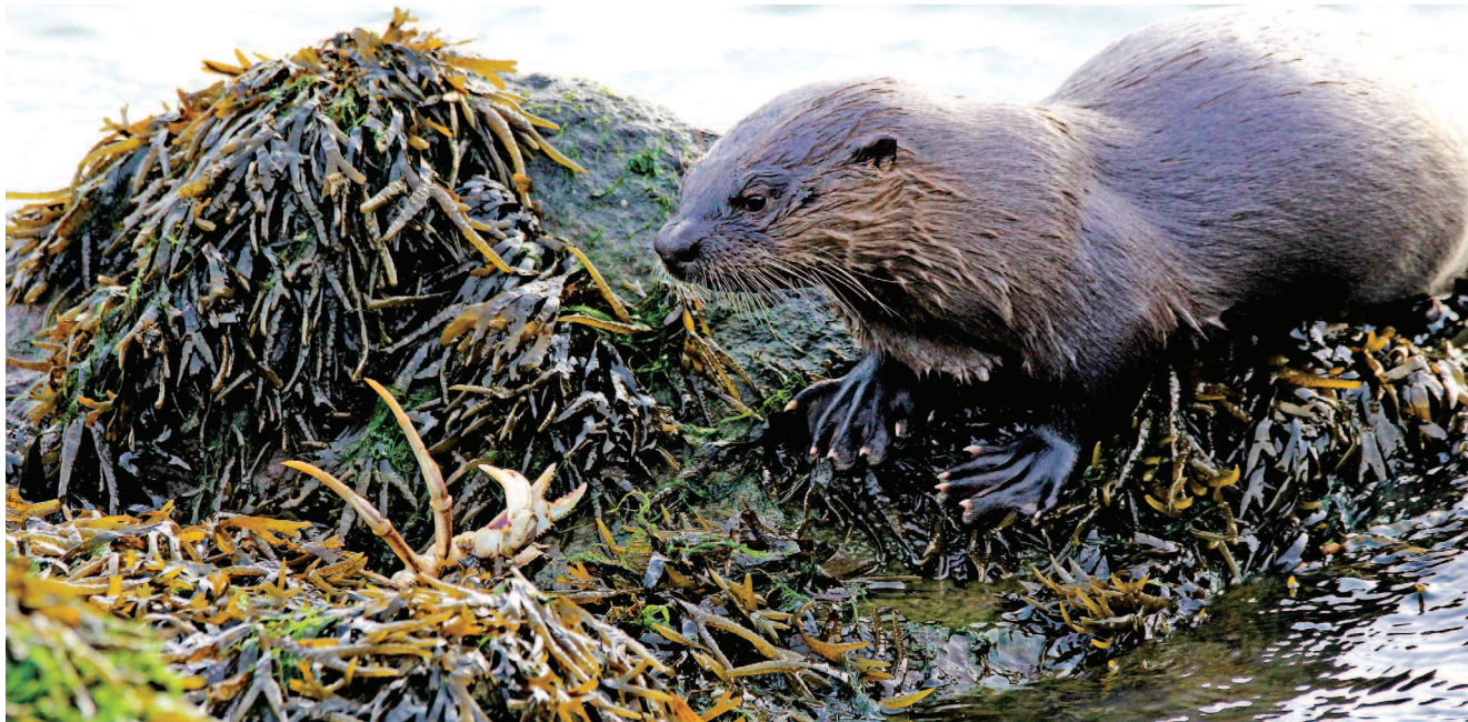
A mother river otter decides how best to neutralize a Dungeness crab at Cape Disappointment boat launch.