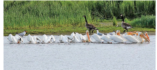
White pelicans used to be uncommon near the mouth of the Columbia, but are being observed closer and closer to the ocean in recent years. These visited the Ilwaco waterfront in the spring of 2017. By the way, a flock of pelicans can be called a squadron, pod or scoop.