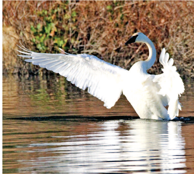
Trumpeter swans hang out in Black Lake in Ilwaco and other lakes and wetlands in the area. There is a major trumpeter swan conservation area near the north end of the Peninsula.