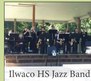
Ilwaco HS Jazz Band