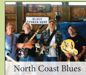
North Coast Blues