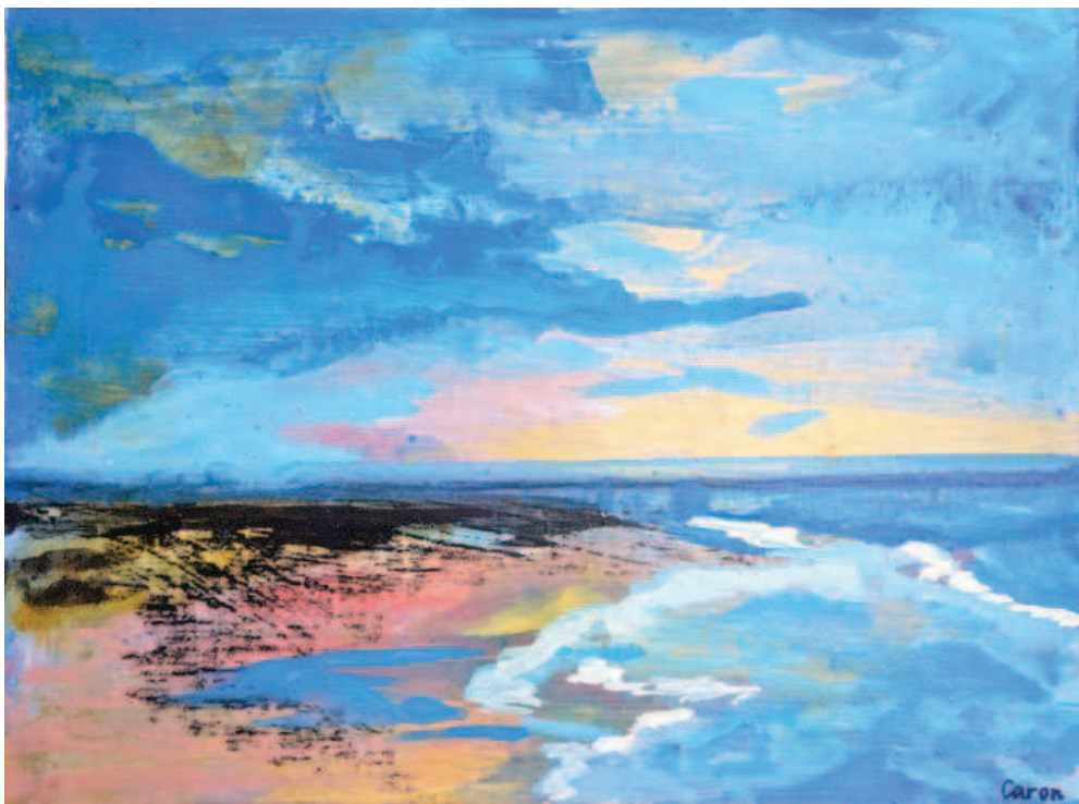
A landscape by Sidonie Caron