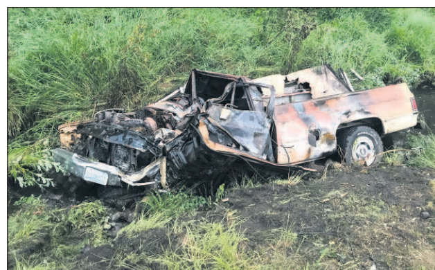
A woman died Saturday in a crash on U.S. Highway 101.